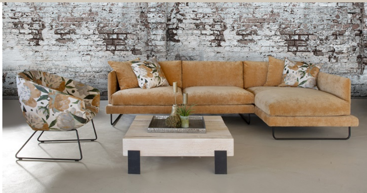
* AL-3W-LK You col. 20